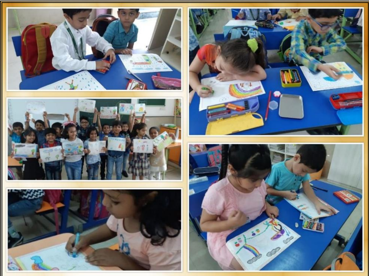
Artists at Work - Creating Posters