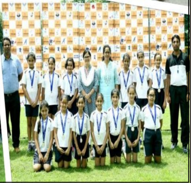
The Winners of the Intramural Tournaments