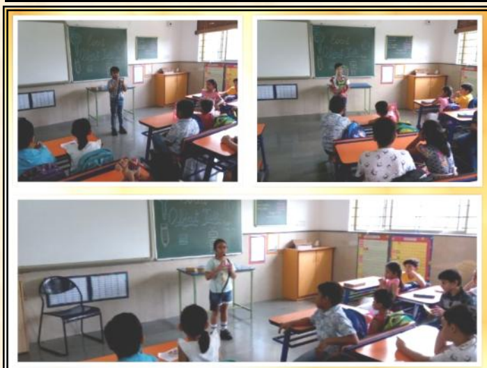
Hindi Poem Recitation