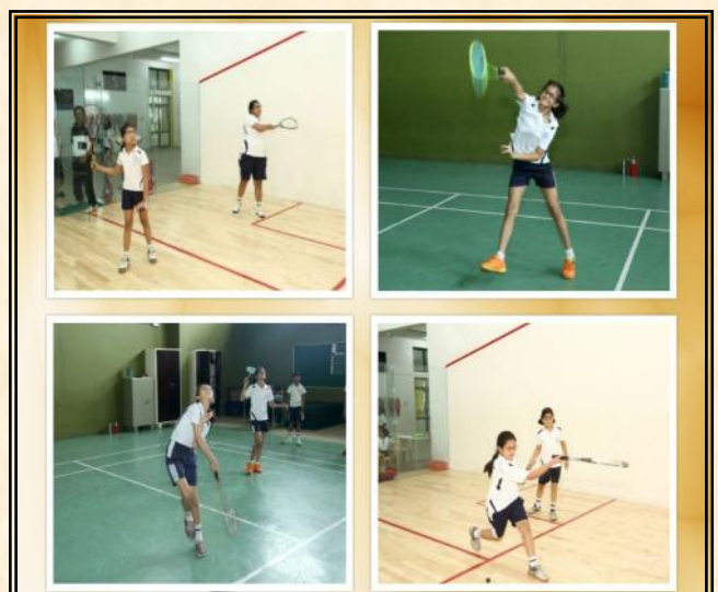
Squashing their Opponent

The Sports Department organized various intramural matches of cricket, football, basketball, squash, chess, swimming and table tennis on the working Saturdays of July for the students of Class V. Our Shishyans enjoyed the various matches and showed their competitive and sporting spirit in all the games played over a month.