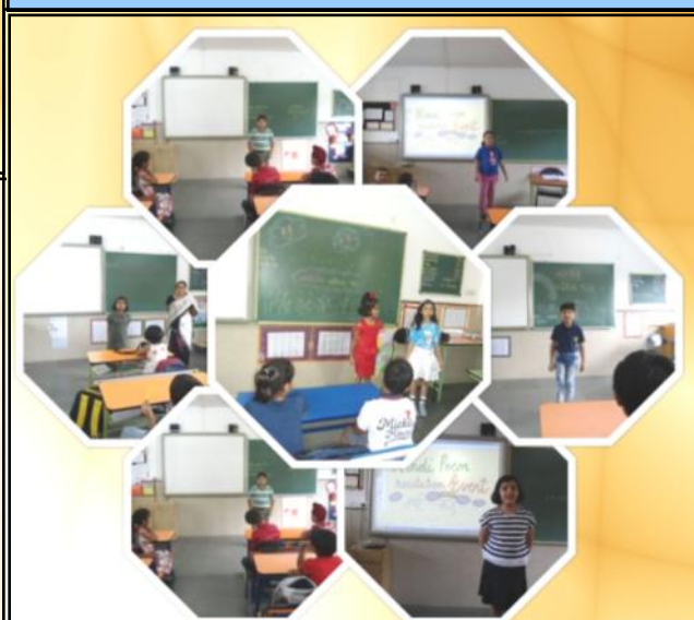
Talking About Their Favourite Object