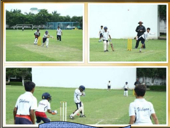
What a Shot!