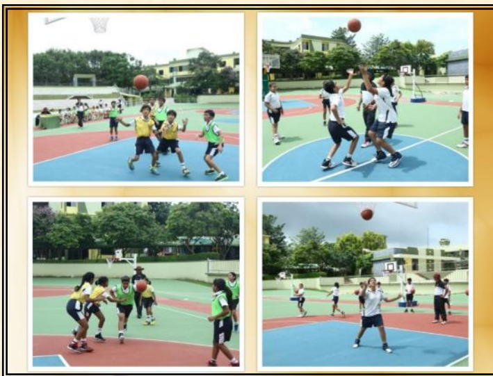
At the Basketball Court