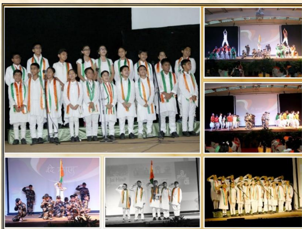
Glimpses of the Independence Day Celebrations (Classes III-V)