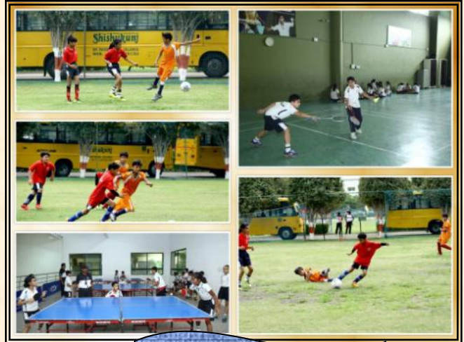
Serves & Goals