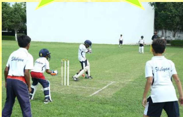
Our Young Players

The playgrounds and the indoor sports complexes of Shishukunj radiated joy and excitement when our young players participated enthusiastically in their inter-class matches. Football, swimming, cricket, basketball, skating, squash, badminton, table tennis and chess were the different sports that the children participated in.