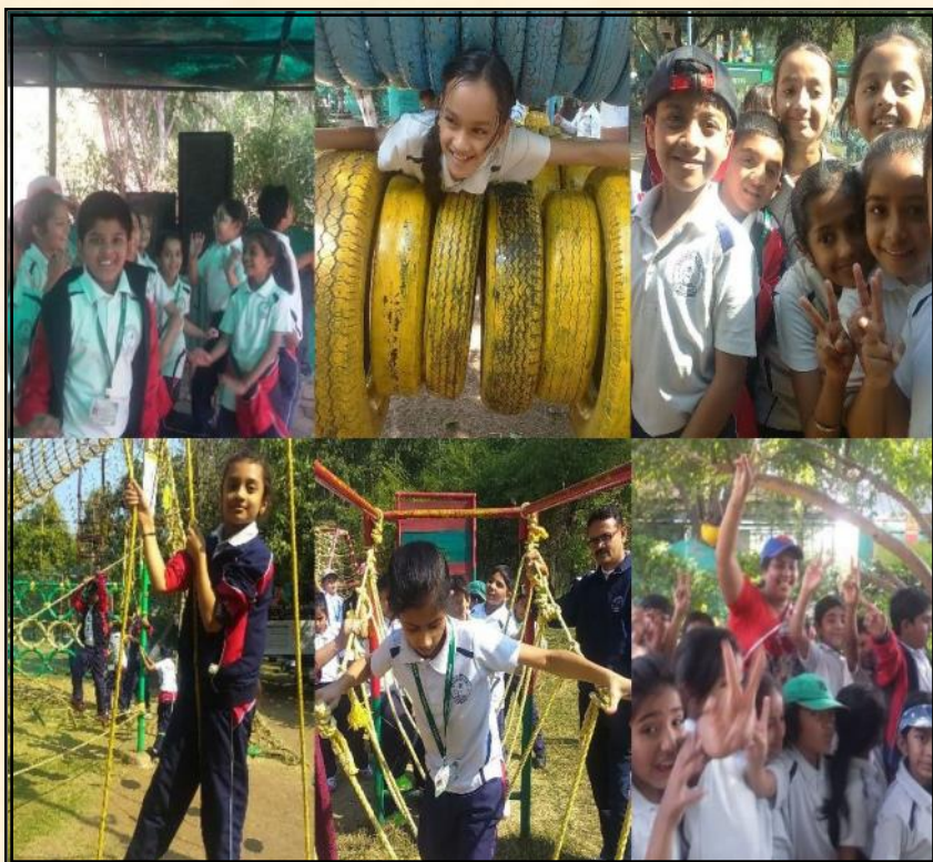
At Safari Activity Park