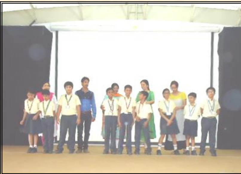
Winners of Quizdom (Class III)