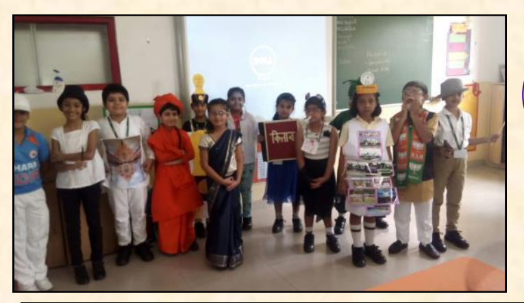
The students of class II came dressed up as Nouns of their choice and they spoke about the same .