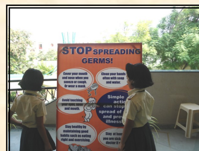
All About Personal Hygiene