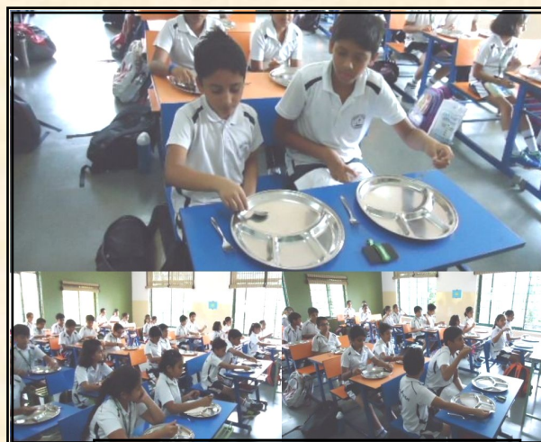
Practising Dining Etiquette

“Kindness and Manners are always in fashion.” This was the thought behind planning the workshop on table manners for the students of Classes II—V. The educators showed videos of dining etiquette and also demonstrated the correct way of using a spoon, knife and a fork, how to eat soup, use the serviette and other important table manners. The students even practised the same in the class with plates and other cutlery provided to them.