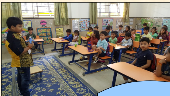
EVENTS IN SENIOR KG

The first PTM was held for all the classes of the Primary Wing. Classes III—V had their PTM on the 5th and 6th of August while Senior KG - II had their PTM on the 26th of August.