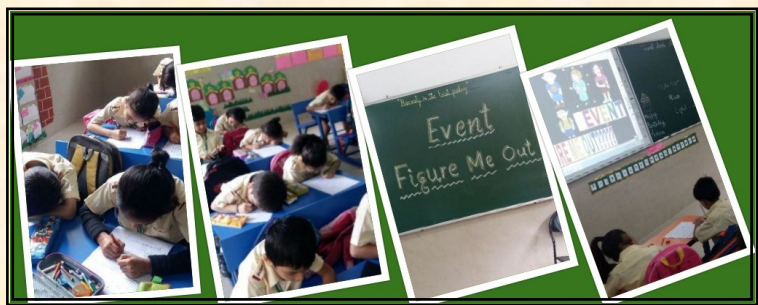
Engrossed in Mathemagic