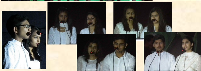
The anchors played a major role in blending the various items into a harmonious whole. Their witty remarks and spontaneity kept the audience glued to their seats throughout the programme.