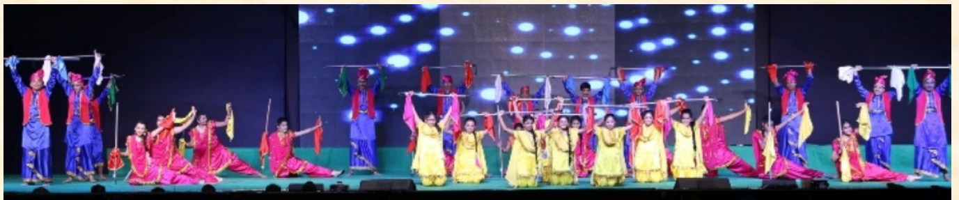
The colourful and graceful Indian dances as well as the synchronized western dances were a visual and musical treat for all.