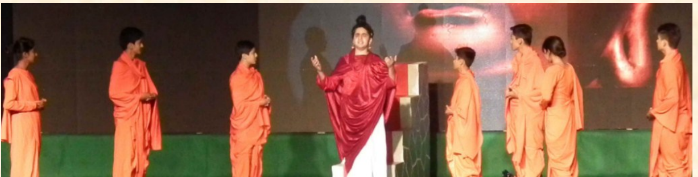
The humorous Hindi play 'Mundan' and the historical 'Ashoka' were also enjoyed and appreciated by the audience.