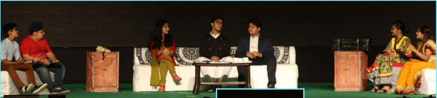
'Marz' - a Hindi satire, brought out a subtle humour in seriously conducted and taken formalities in the Indian socio-cultural background.