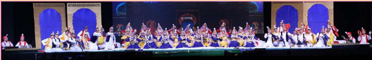
Shishyans celebrated the resurrection of Qawwali and through it highlighted the way with which learning takes place in the campus.