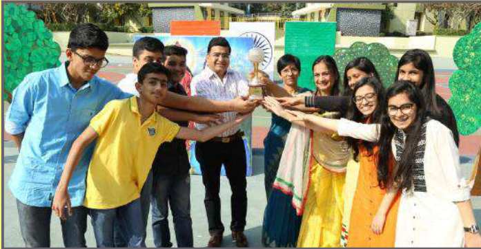
House with Highest Attendance Kalam House