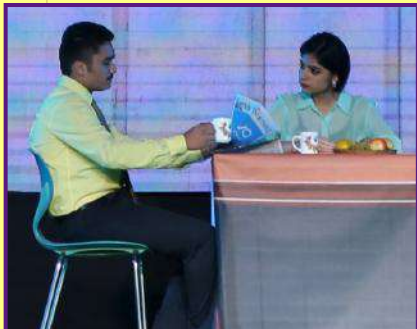
The English Play, 'The Eternal Shakespeare', showcased the timeless relevance of the Bard by drawing a parallel between power-politics in the past and the present.