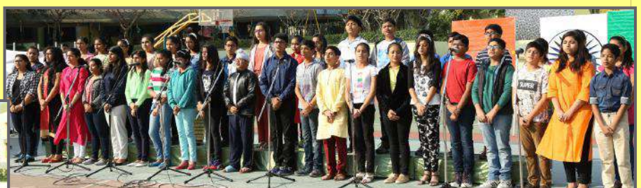
Rajasthani Patriotic Song