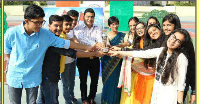
House with Best Performance Kalam House