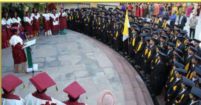
Graduation Ceremony 2017