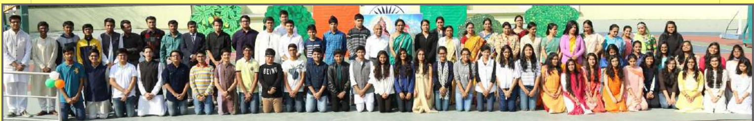
Participants of Bal Vigyan