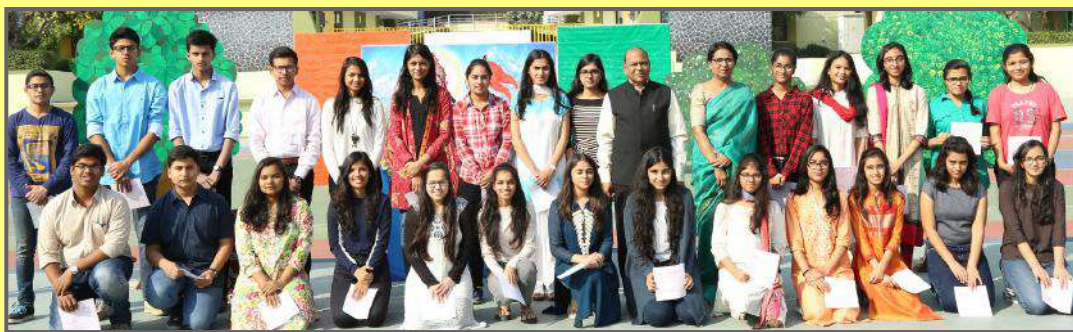
Meritorious students who scored 10 CGPA in Class X in 2015-16