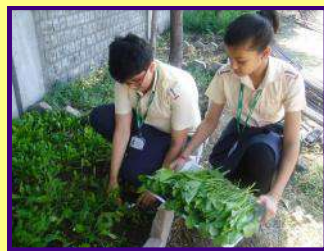
The students grew seven different varieties of vegetables organically in the school garden.