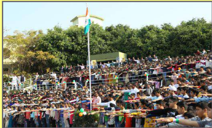
Administering of the pledge by the Students Council.