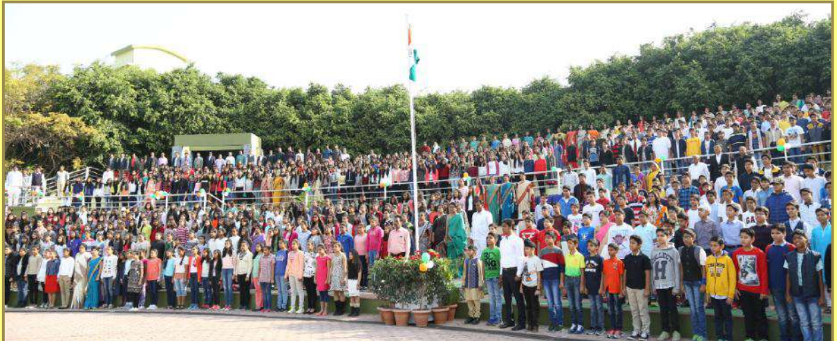
68th Republic Day Celebration