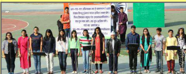
Original composition of the National Anthem comprising of five-stanzas sung by the choir and explained to the audience.