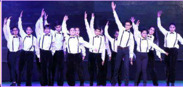
The Western Dance infused with elements of jazz and hip hop, conveyed how employees of the corporate world mortgage their souls to cut throat competition and long for liberation from the same.