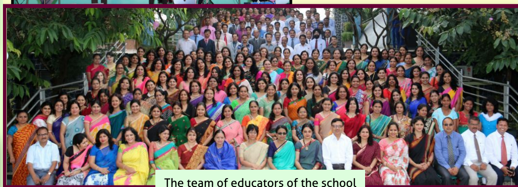
The team of educators of the school

Enthusiasm was in the air for the entire week as the creative Shishyans decorated their soft boards for the Inter Class Display Board Decoration Competition on August 15.