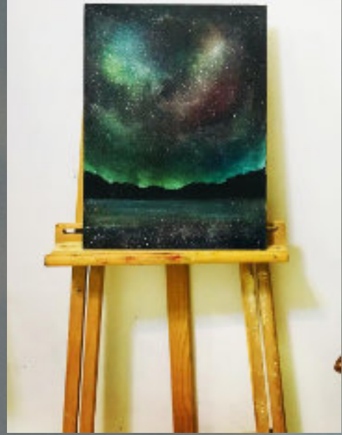
- Swasti Solanki, Class XII