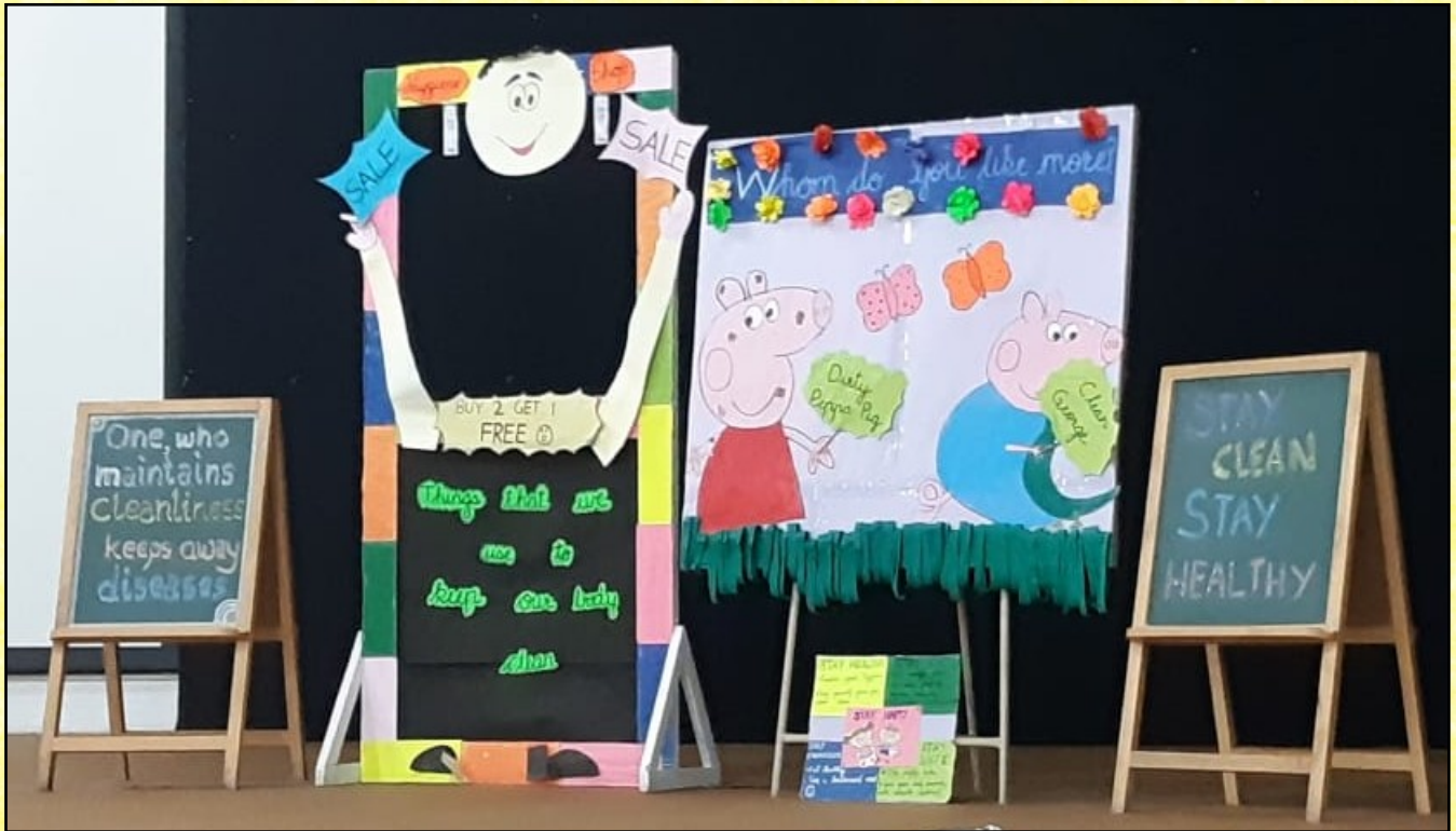
Personal Hygiene Workshop (conducted by the educators of Classes I to V)