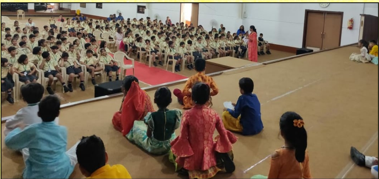
Assembly on Janmashtmi by the children of Class II E