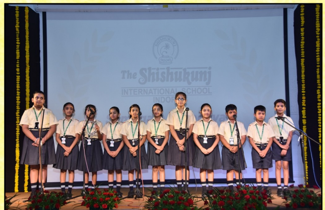
The Performance of the Shishukunj Choir