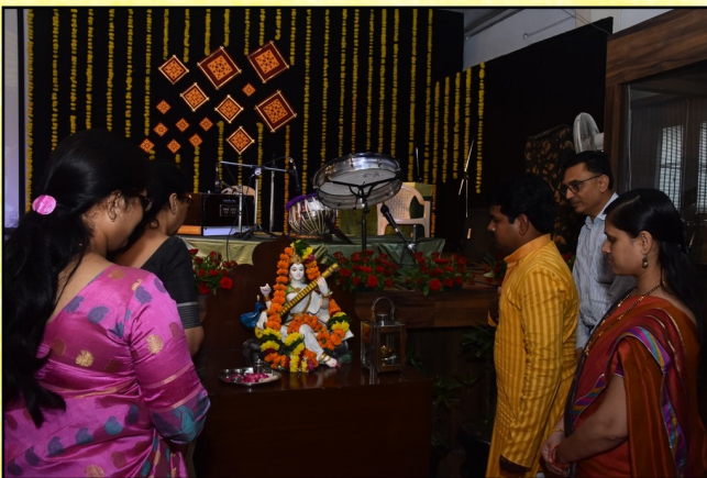
Invoking the Blessings of the Deity

Shishukunj hosted the Sahodaya Samagam Inter School Group Singing Competition. Being the host school, Shishukunj did not compete with the participating schools. However, the event began with a patriotic song presented by the Shishukunj choir. The students of Delhi Public School, Sri Sathya Sai Vidya Vihar and Vidyasagar School bagged the trophies for the three best performances.