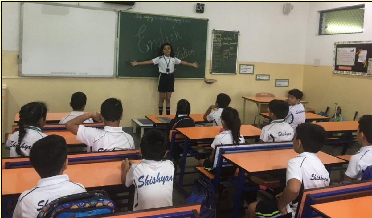
English Recitation Event in Classes III and IV