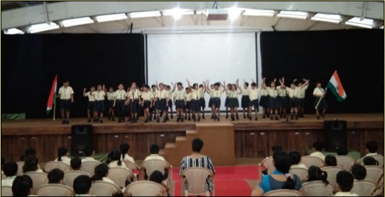
Assembly on Independence Day by the children of Class II D