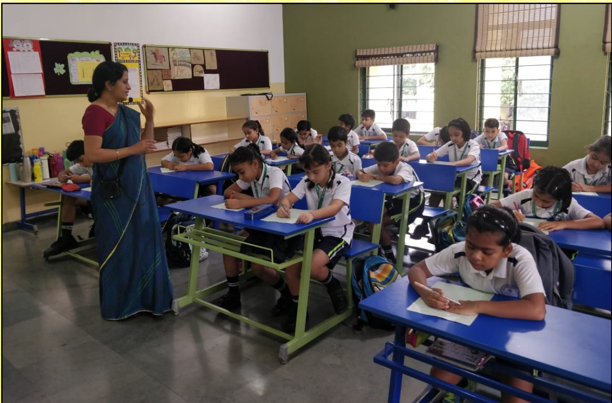
Listening Skills Event in Classes III and IV