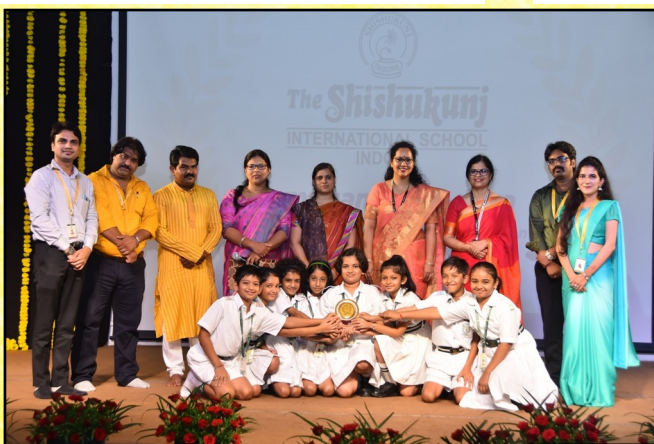
The Winning Teams