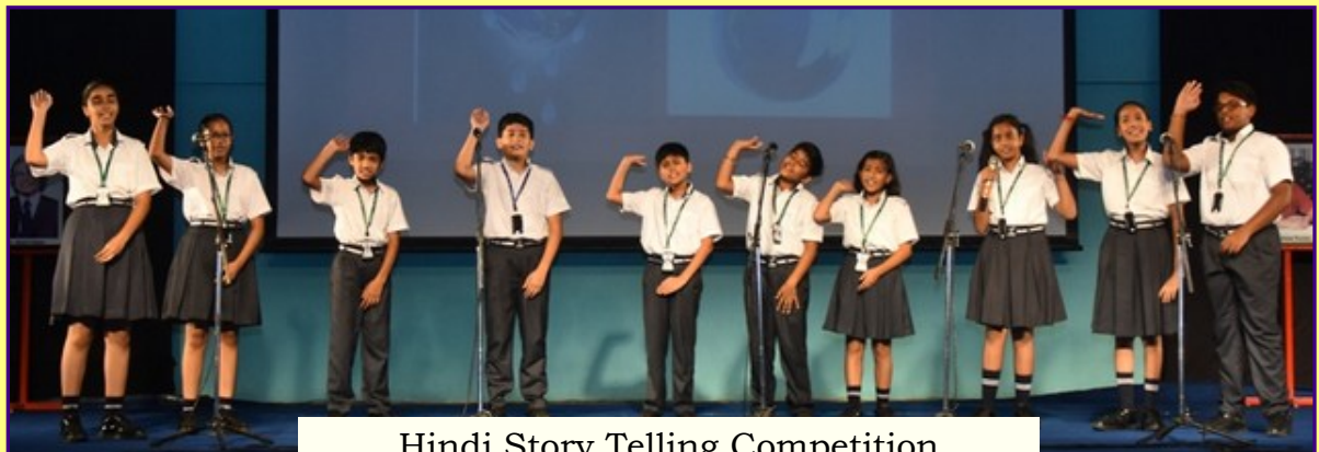
Hindi Story Telling Competition Classes VI-VIII