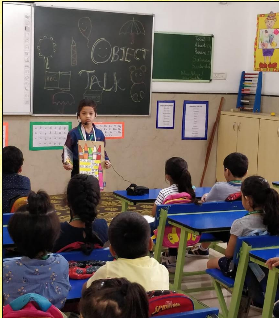
The children of Sr. KG participated in the Object Talk Event wherein they brought their favourite object to school and spoke a few lines about it.