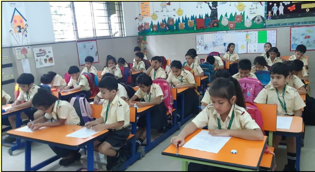
Word Power Event in Classes I and II