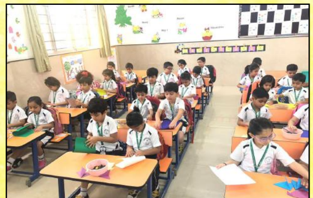
Origami Week in Sr. KG and Classes I & II