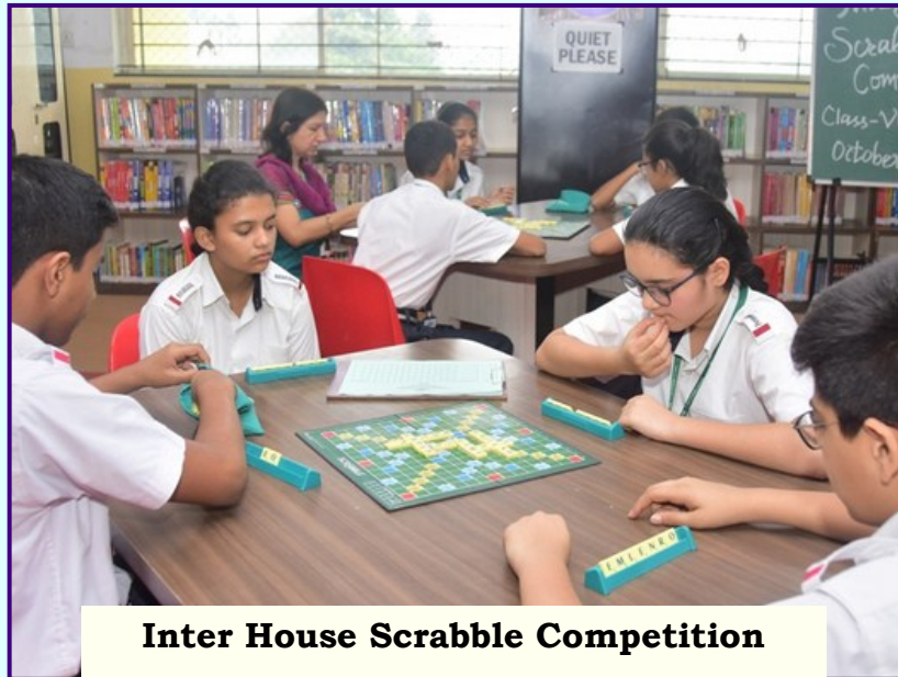
Inter House Scrabble Competition