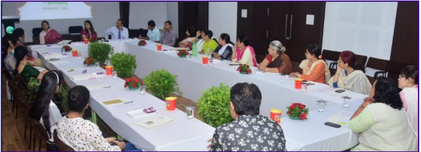
AFS Chapter Meet to discuss and plan various international student exchange programmes.