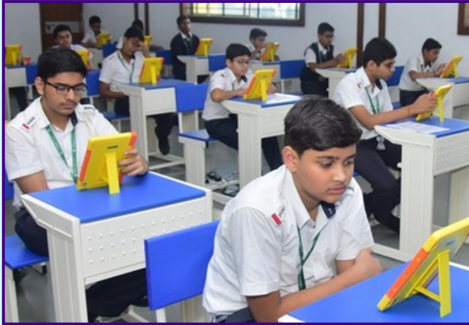
TCSion IntelliGem Contest