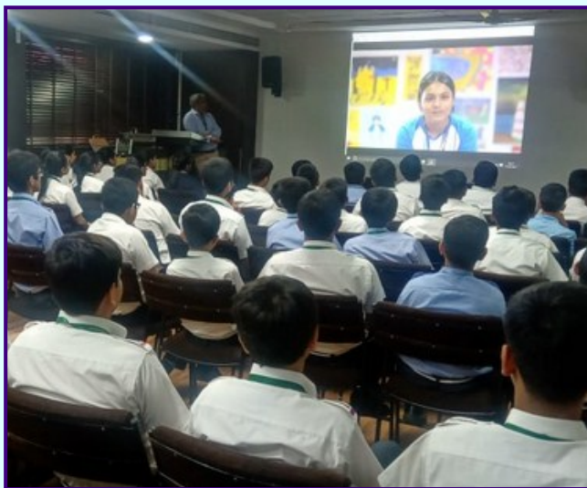
ASSET Day Scholar Orientation Program