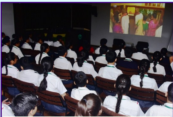
Watching a documentary on Gandhi