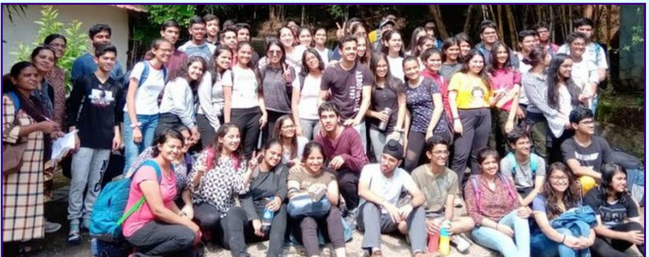
Annual excursion of students of Class XII at Flame of the Forest, Indore.