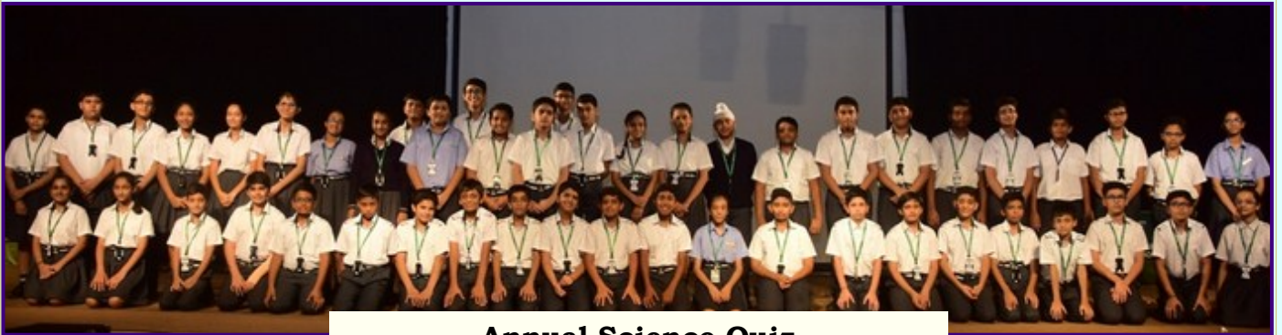
Annual Science Quiz Classes VI-VIII