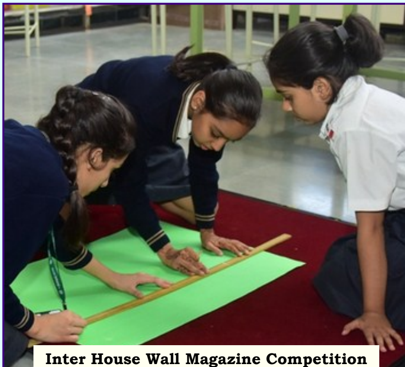
Inter House Wall Magazine Competition Classes VII and VIII