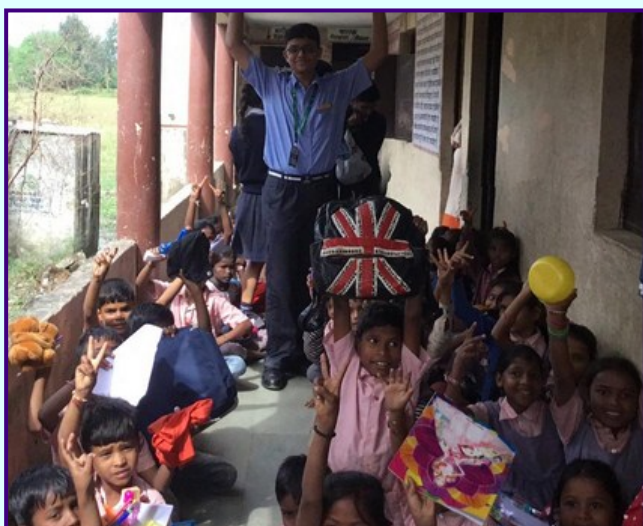
Extending a helping hand. Shishyans at a government school in village Tigeria Rau distributing stationeries and toys.