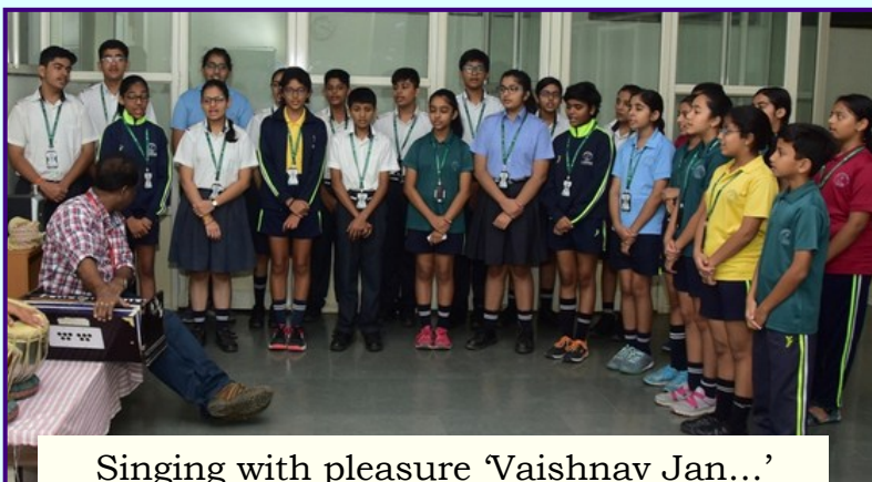
Singing with pleasure 'Vaishnav Jan...'