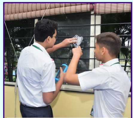
Cleaning the classroom