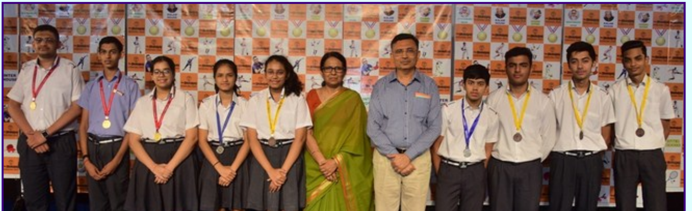
Sport Week Prize Distribution Ceremony