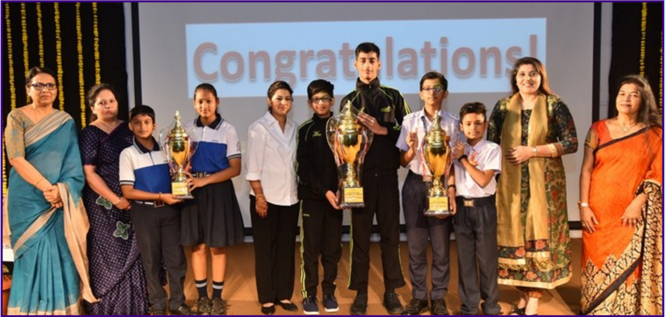
8 th Shri Jugrajji Mehta Inter-School Word Power Competition hosted by Shishukunj