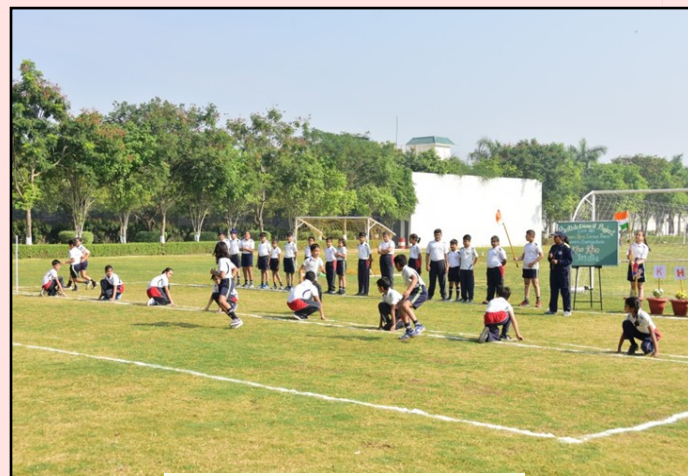
Kho - Kho