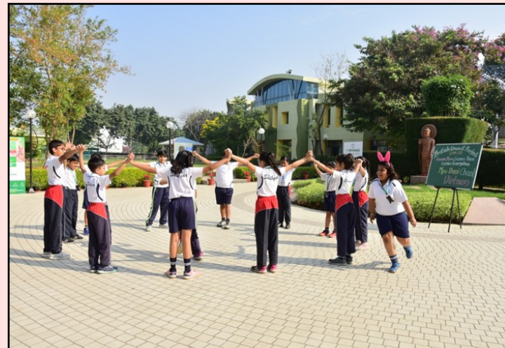
Meo Duo Chuot