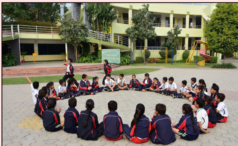
Corre Corre La Guaraca