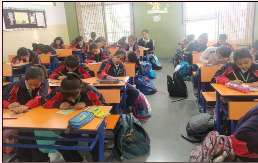
Shishyans making invites for Navaarohan