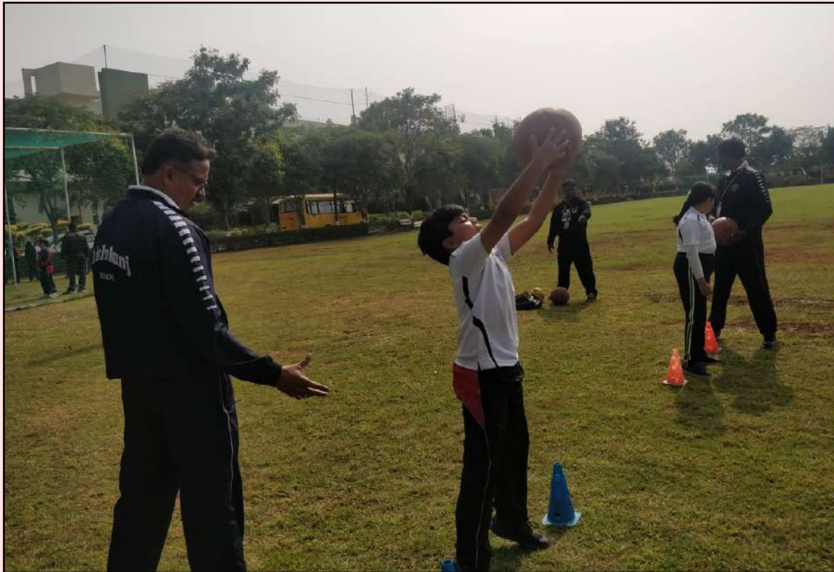
Overhead Backward Throw