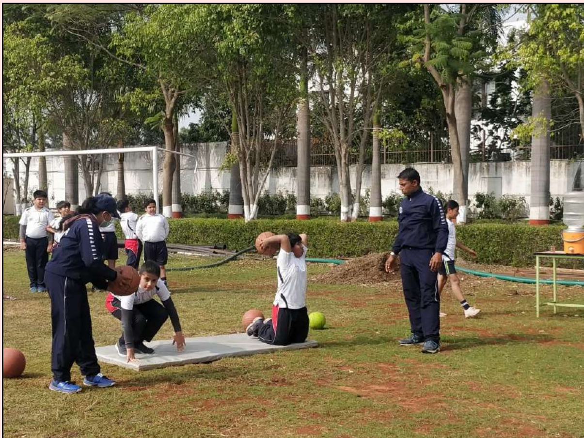
Knee Bend Throw