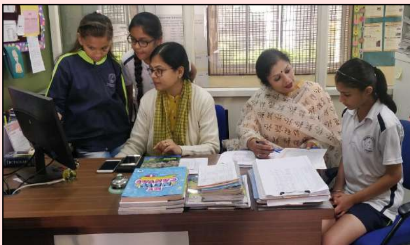
The anchoring team of Navaarohan gearing up for the event