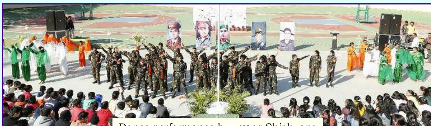
Dance performance by young Shishyans