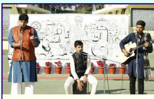
Song by Class XI students