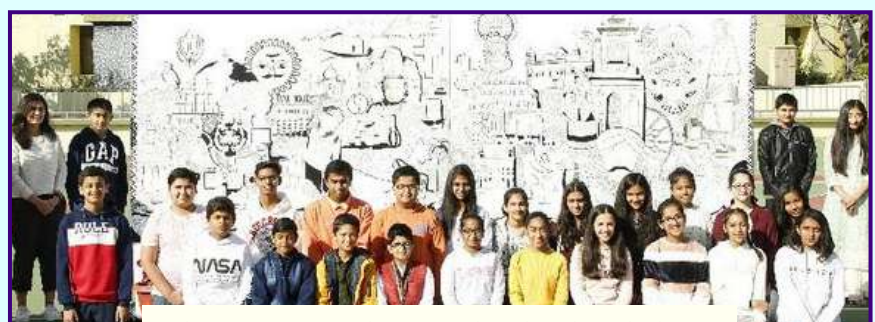
The artists who made the backdrop