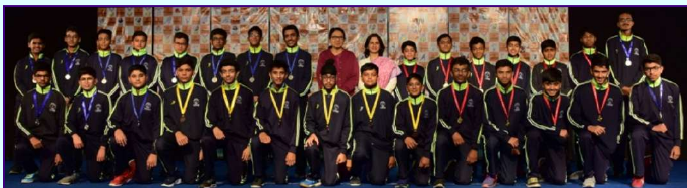
Inter-House Sports Award Ceremony Classes VIII and IX