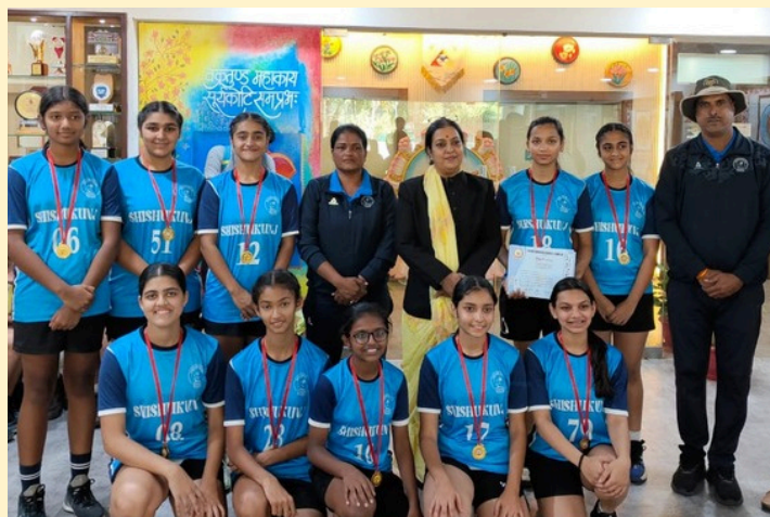
Shishukunj Girls' Basketball team won the Gold Medal at Sahodaya Samagam U-19 Girls Basketball Tournament held at Prestige Public school.