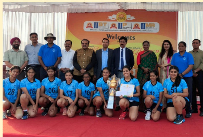
Girls' Basketball Team won the Gold Medal in the Apratim Pragya Pratispardha Sports League held at Indian Institute of Science & Technology.